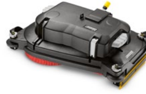
Brush heads D 75 / D 90