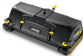
Brush heads R 75 / R 90

■ Included in delivery. □ Optional. 1) 330 Ah, low-maintenance. 2) 360 Ah, low-maintenance. 3) 312 Ah AGM low-maintenance.